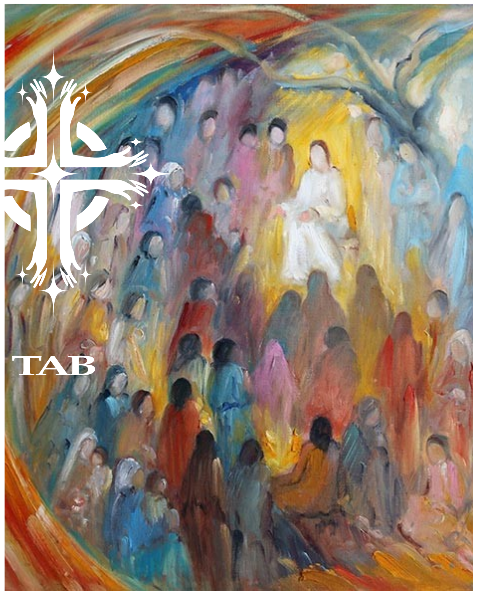
Tabernacle Presbyterian Church INDIANAPOLIS, INDIANA