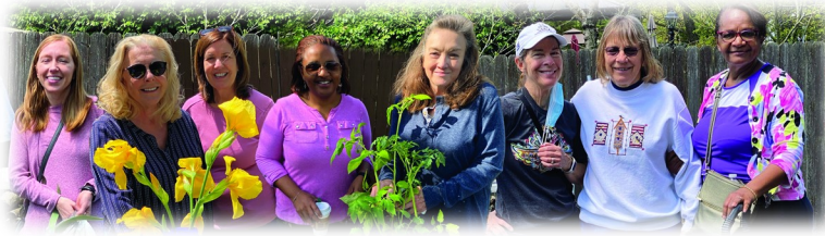
Women of Tab 2022 Exchange