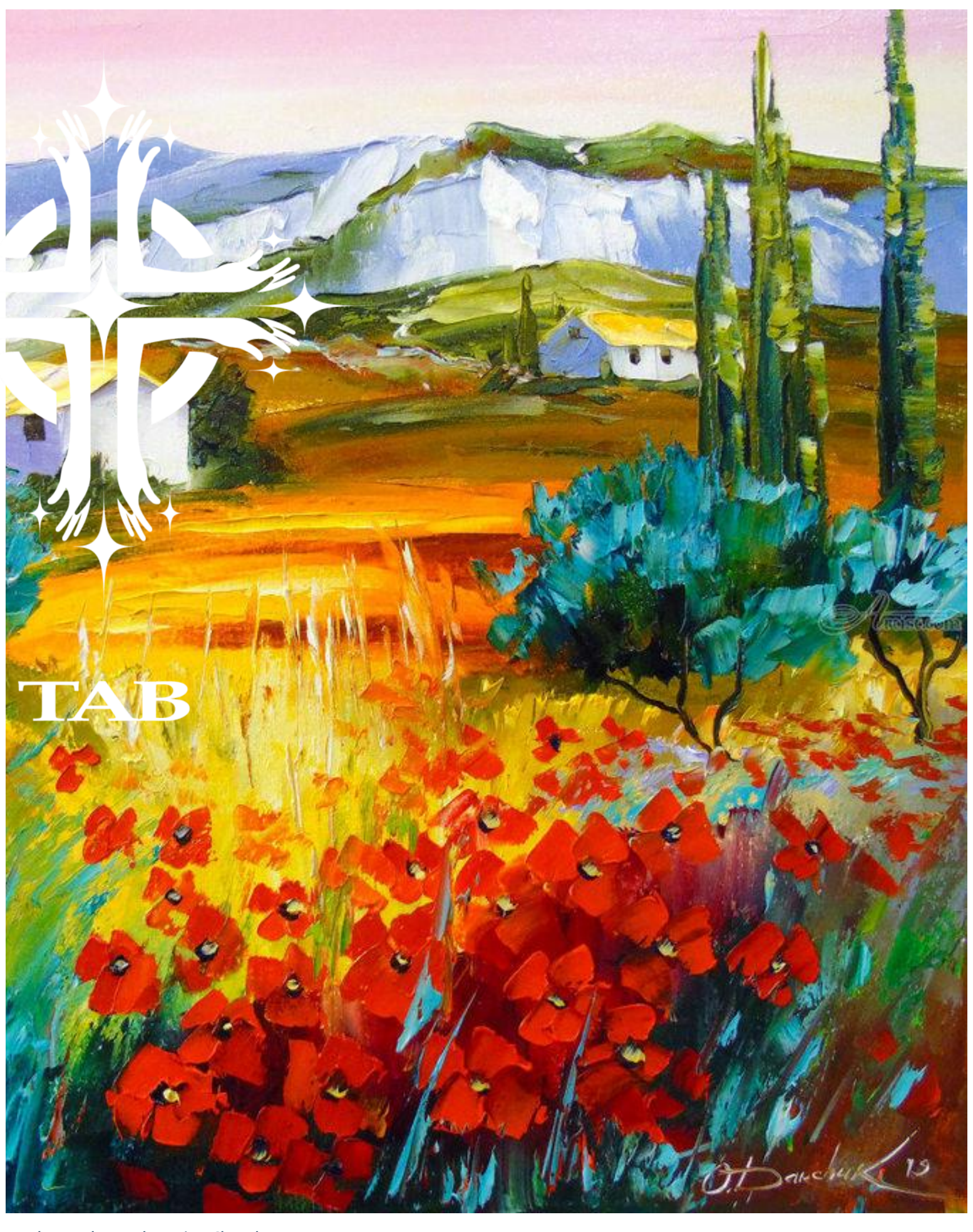
Tabernacle Presbyterian Church INDIANAPOLIS, INDIANA