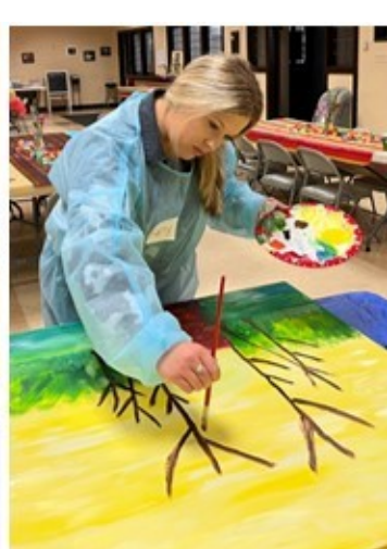
Gradeless Dental staff members painting their own interpretation of the original example by Taylor Walker.