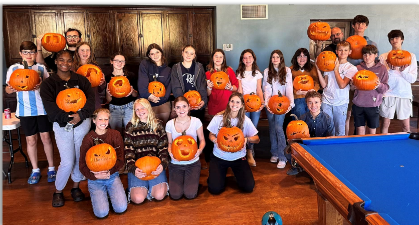
Tab Youth's pumpkin-carving night, October 22