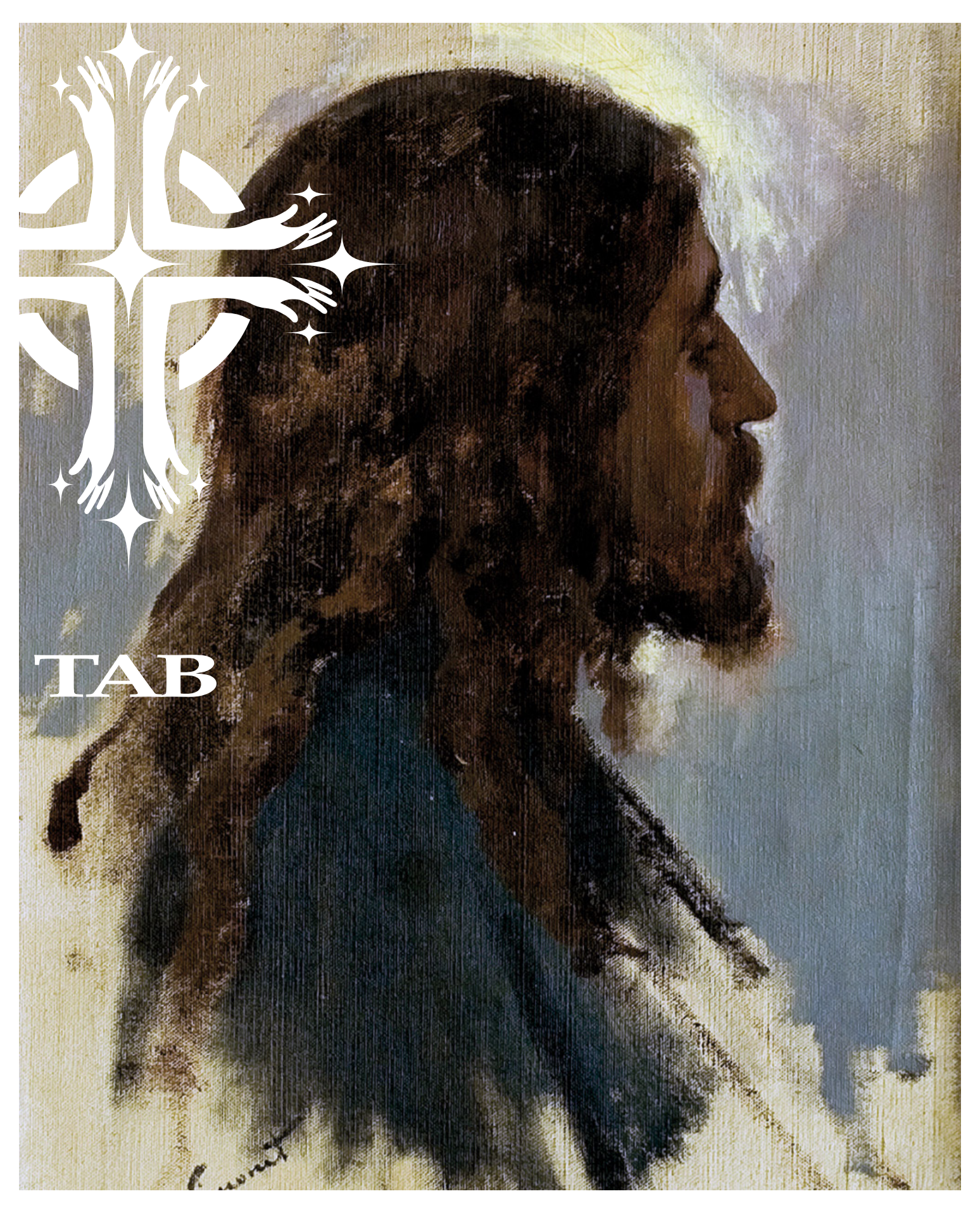
Tabernacle Presbyterian Church