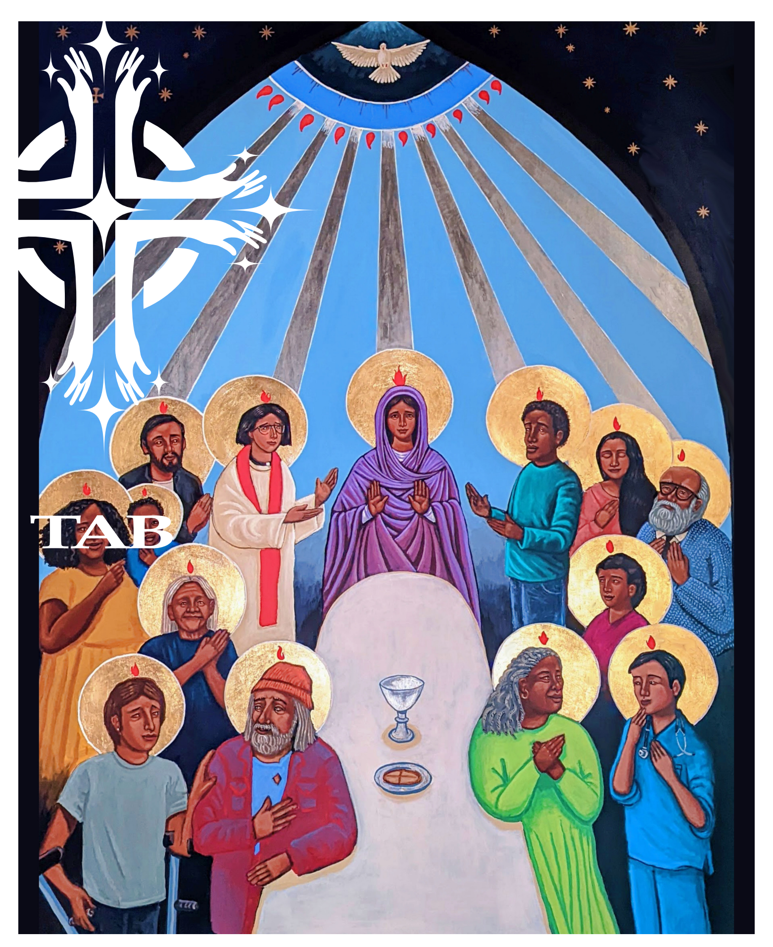
Tabernacle Presbyterian Church