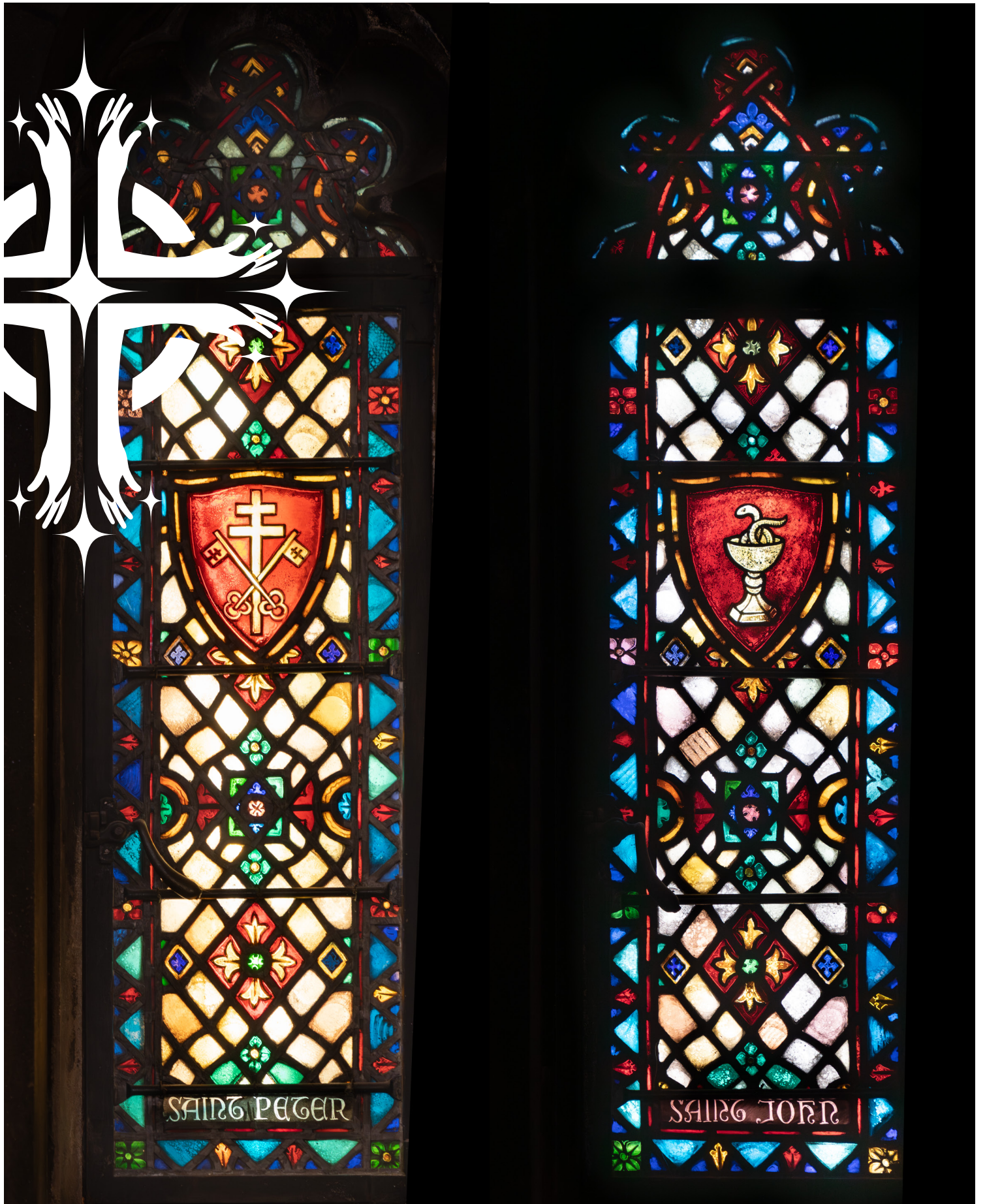
Tabernacle Presbyterian Church INDIANAPOLIS, INDIANA